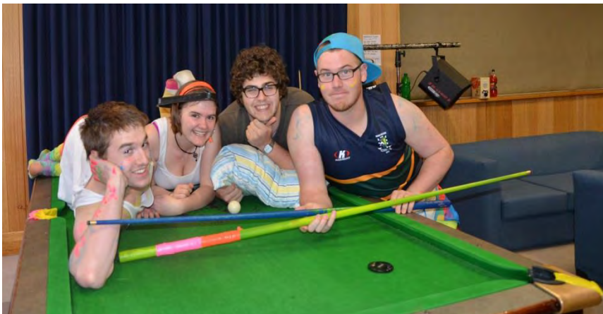
Dawn Stone Youth Health Nurse